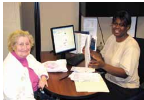
Resident has her taxes prepared by MABC preparer