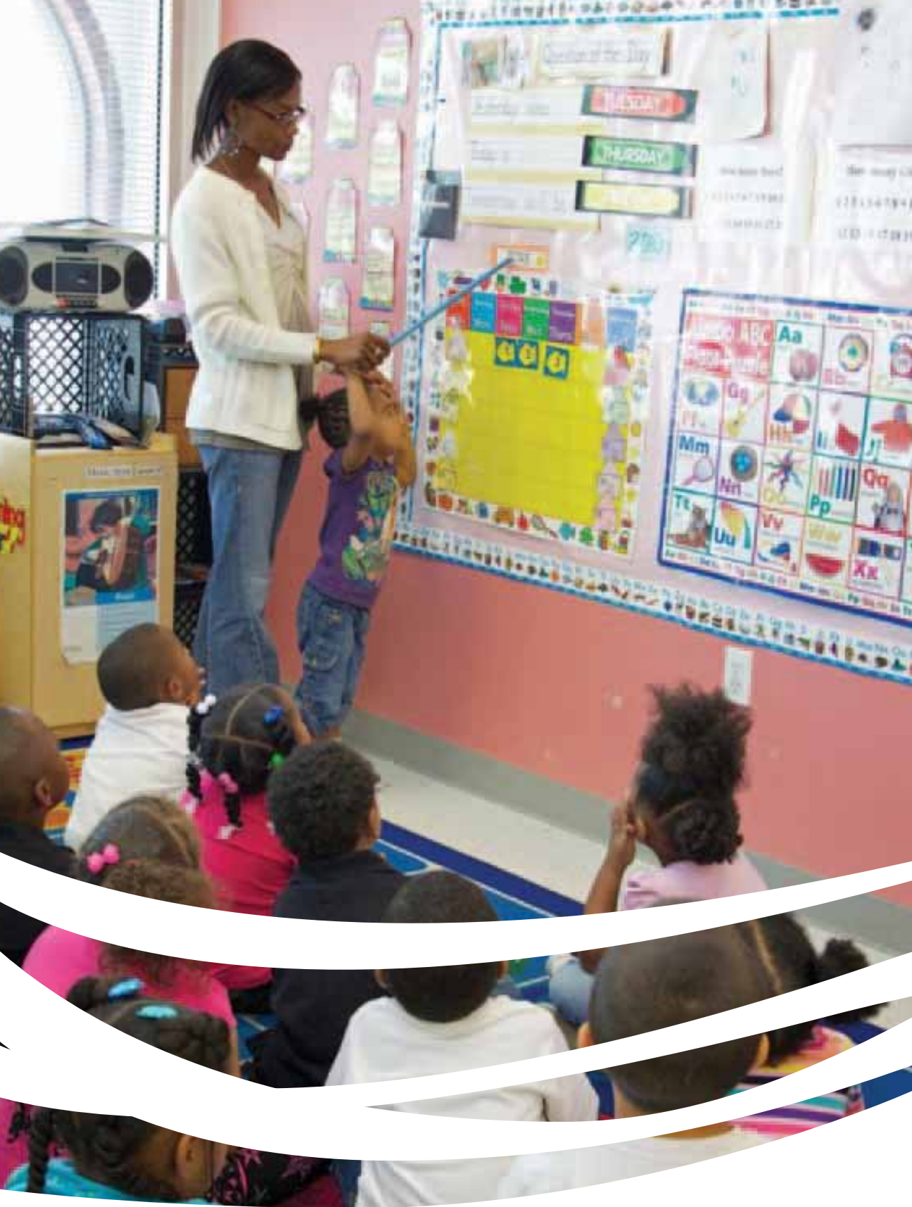
Head Start provides high quality early childhood education.