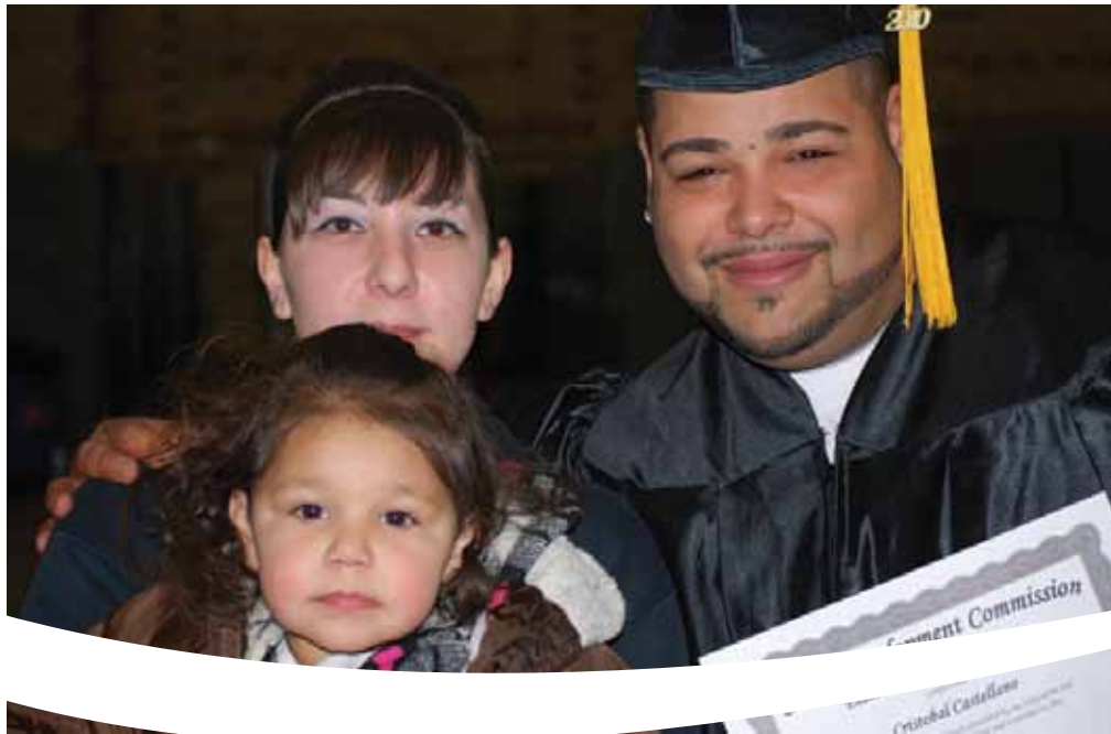
A GED student shares a moment of glory with his family at graduation.