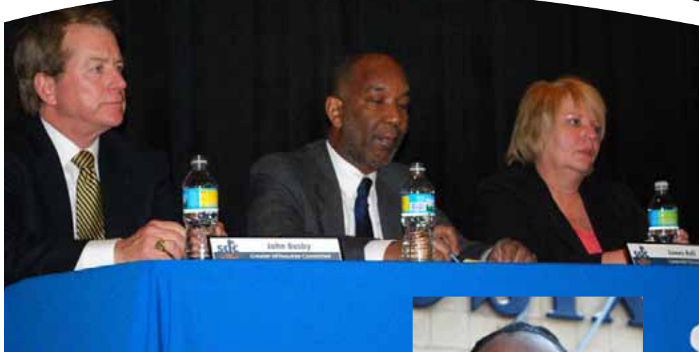
SDC Board members listen to voices from the greater Milwaukee community at an SDC Public Hearing.

In the 2010 program year the SDC collaborated with 265 organizations to promote family & community outcomes.