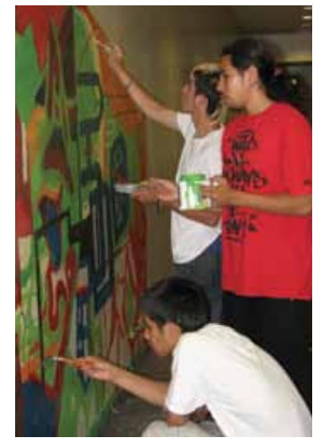
At risk youth are inspired to create murals of their own.