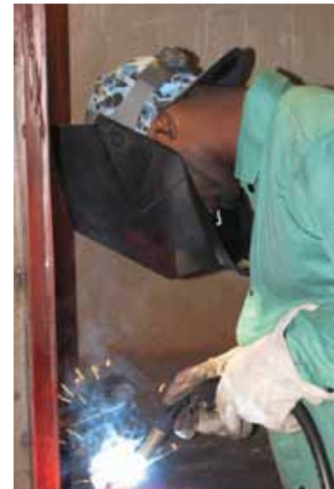
Residents are connected to job opportunities through the Transitional Jobs program.