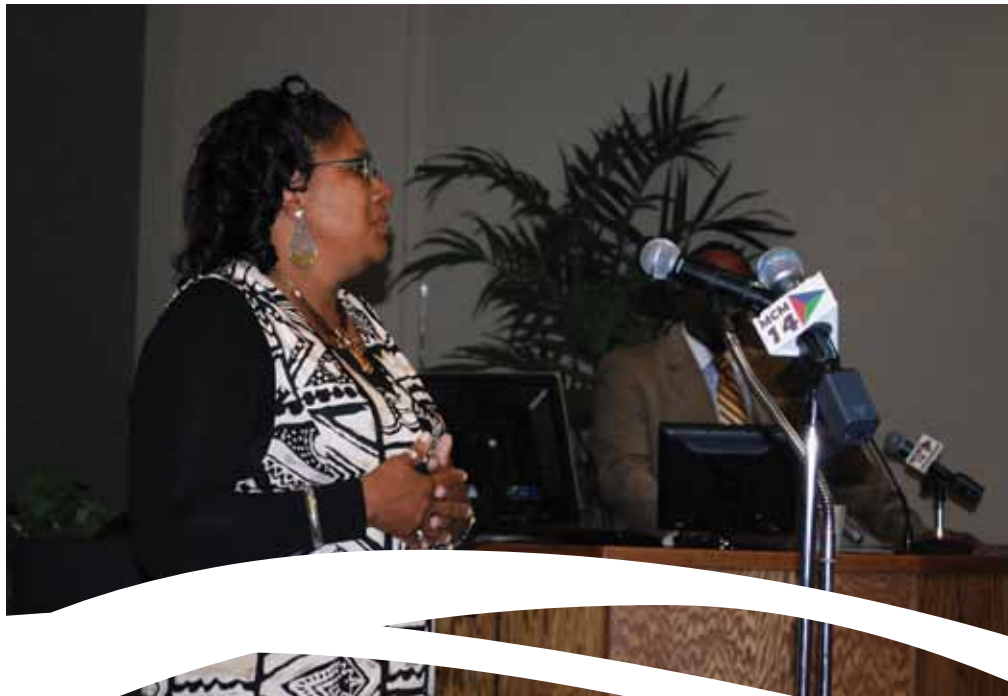
Member of the community testifies at SDC Public Hearing on the link between substance abuse and poverty.