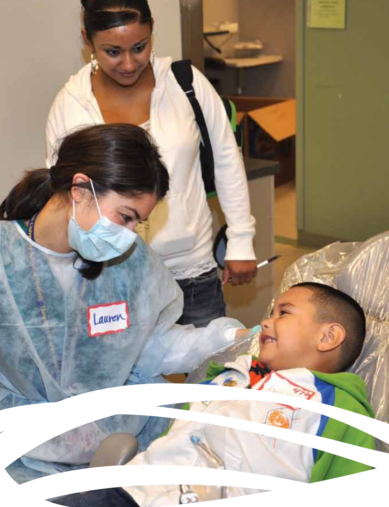
Dental and health screenings are a regular part of Head Start Curriculum.