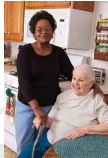
Senior Companions allows older adults to remain in their homes with help from a friend.