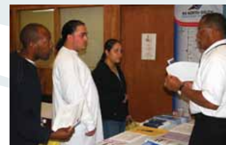
The SDC Job & Resource Fair brings job seekers and employers together for mutual beneficial opportunities.